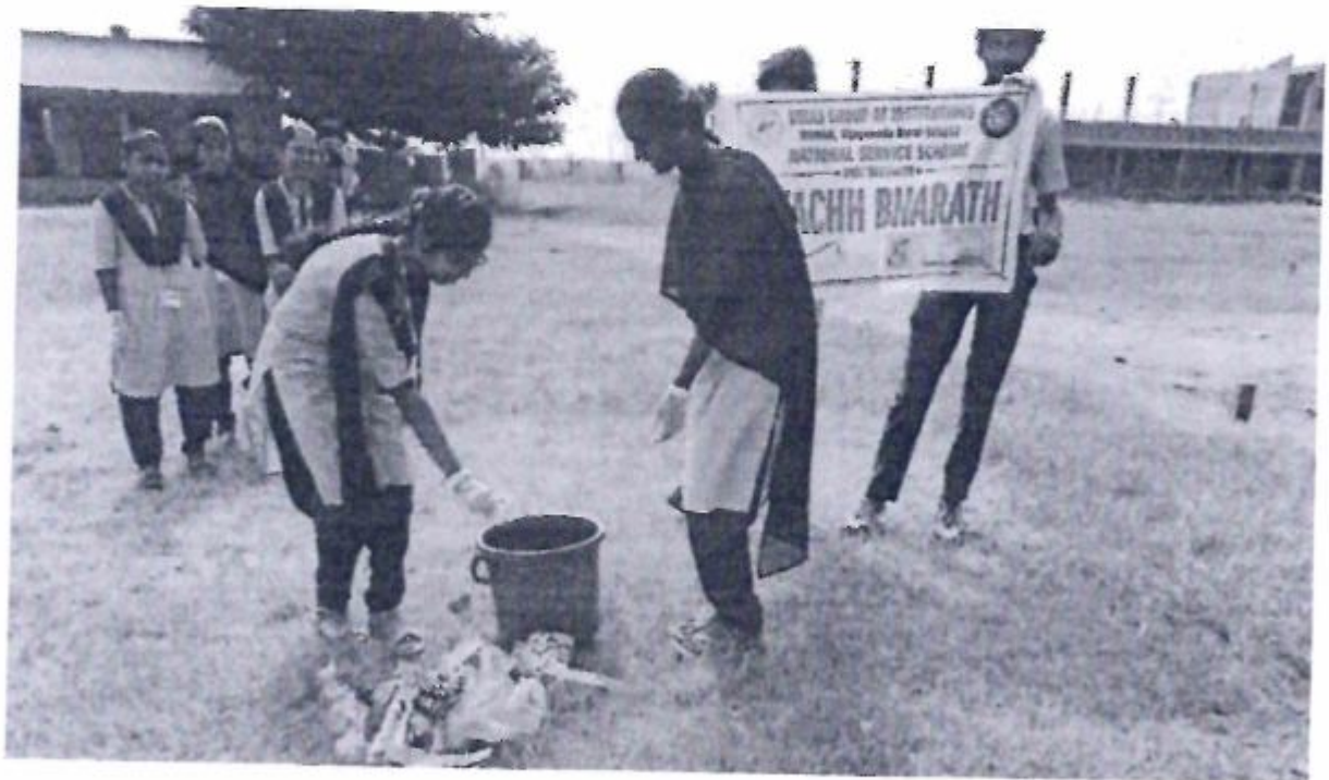
Clean the ground