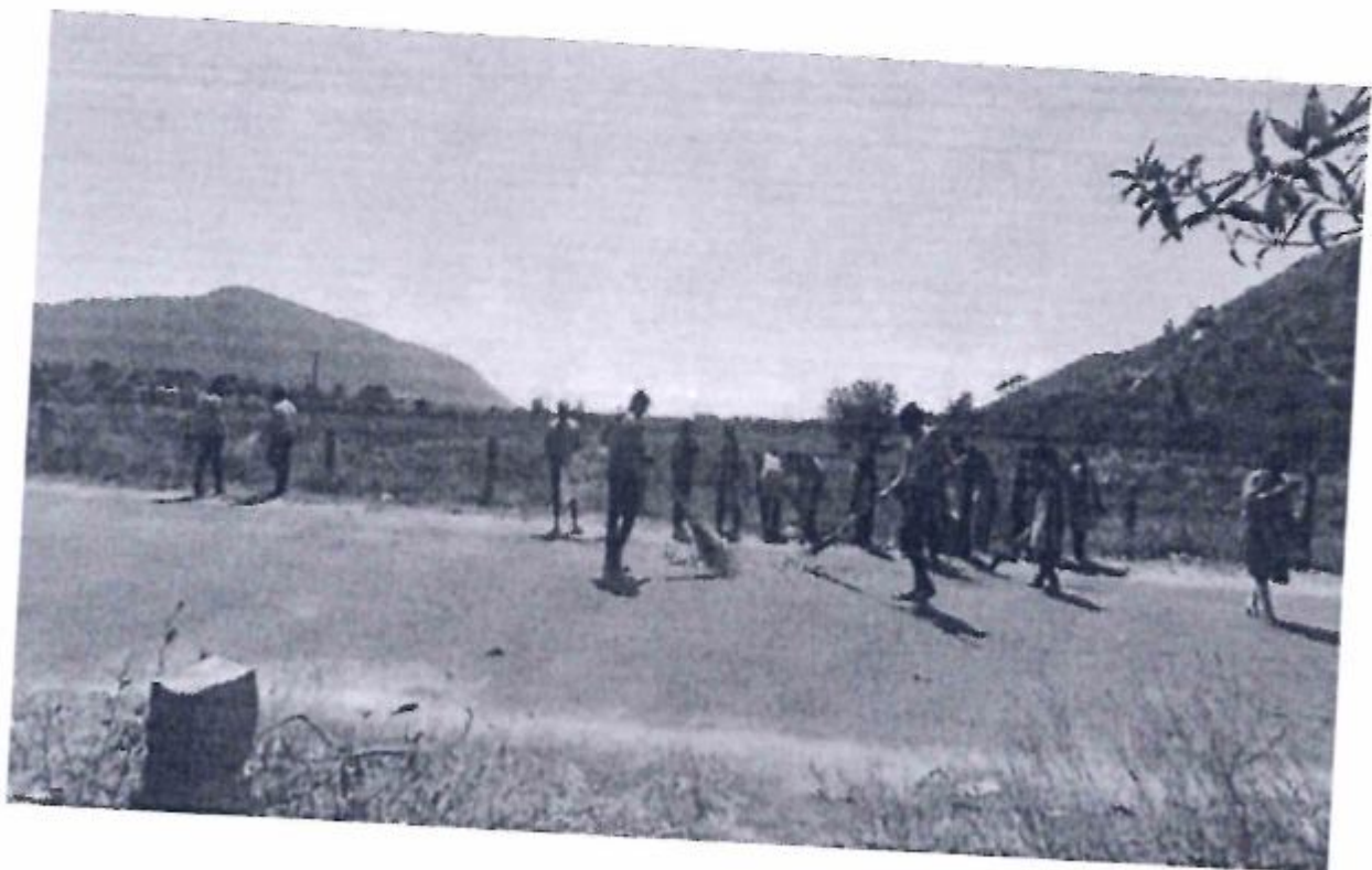
Clean The Road