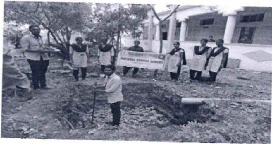
Water Harvesting Pit