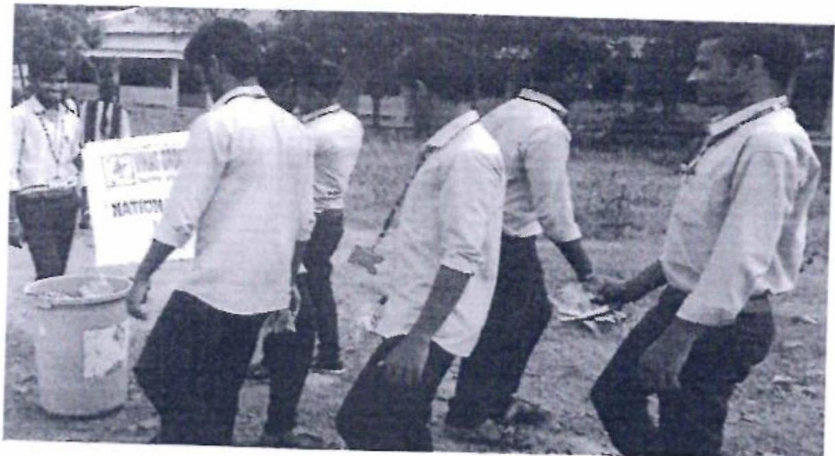
Clean the Plastic