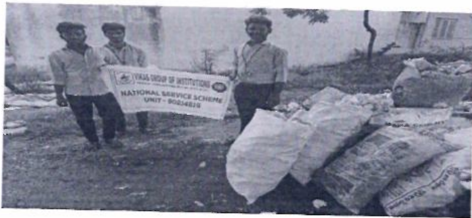
Clean the Plastic